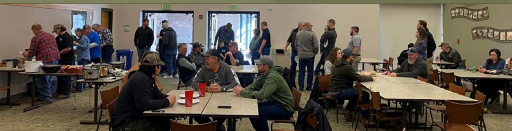
NICHES Hunters gather at the Wright Center for our 3rd Annual Potluck and organizational update.