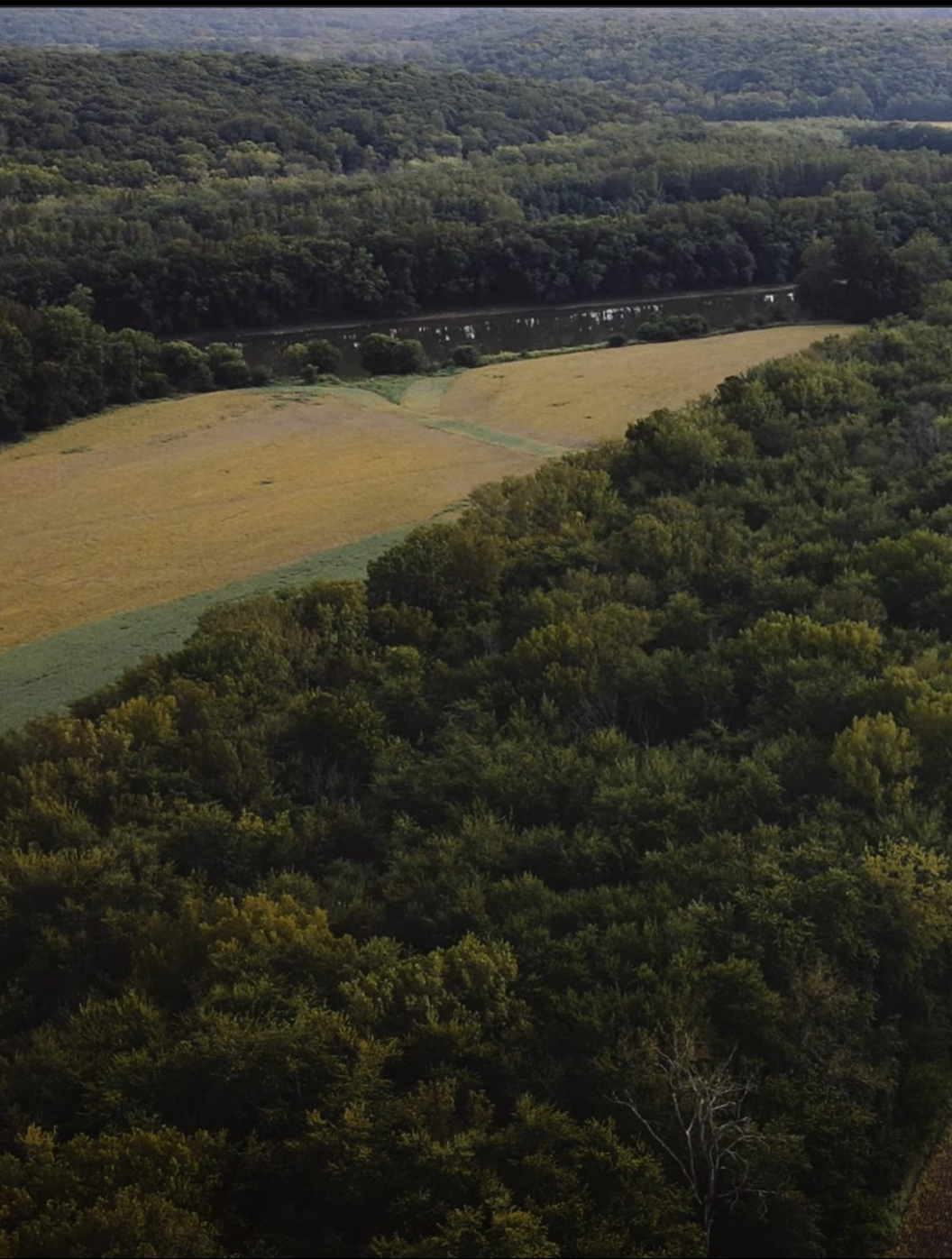
Aerial view of NICHES Laura Hare Bend of the Wabash East Preserve in 2022.