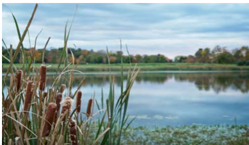
Concern for the protection of West Lafayette's Celery Bog Nature Area was a major catalyst in NICHES Land Trust's founding.

and the arrival of Wal-Mart was greeted with dismay and led to a number of community meetings.